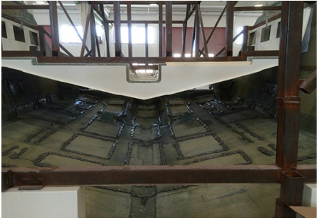
SCIGRIP's Methacrylate adhesives have been used for years in structural bonding applications in the marine sector, reducing surface preparation requirements and providing a versatile bonding system that can be tailored for the individual gap size and working time requirements of each job.