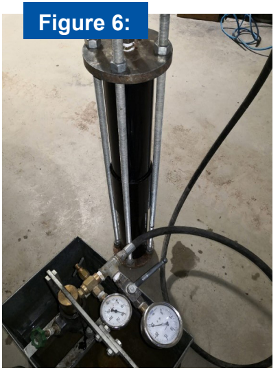
Pressure test showed the joint is gastight up to 25 bar

Cross section of the cured joint. The visible o-ring sealings define the bond line thickness. Additionally, SG5000 created a homogeneous bond line around the GFRP pipe